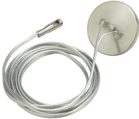
Shown approximately 15% actual size.