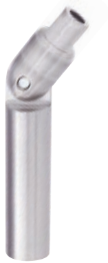
Shown approximately 65% actual size.