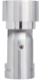
Shown approximately 45% actual size.