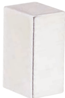
Shown approximately 135% actual size.