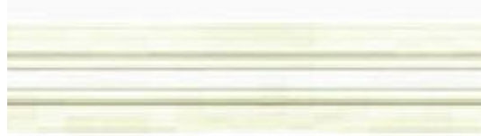
Shown actual size (.6" height x .3" width)