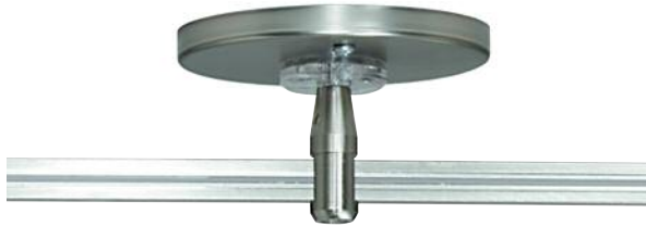
Shown approx. 35% actual size.