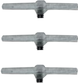
Shown approx. 110% actual size.