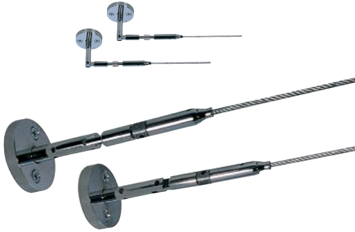
Shown approx. 25% actual size.