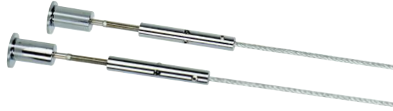
Shown approx. 35% actual size.