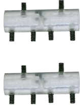
Shown approx. 75% actual size.