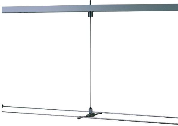
Shown approx. 10% actual size.