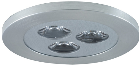
Fixtures may be surface or recessed mounted

Designed for high efficiency, low wattage, shelf and cabinet display lighting solutions.