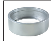
PK H600B (Order separately) Aluminum housing for surface mount 3" Ø x 1" H