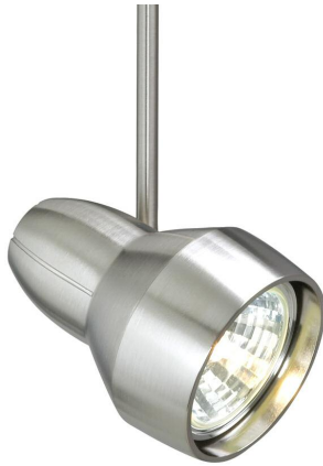
OM WITH SOLID METAL OM ACCESSORY