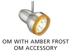
OM WITH AMBER FROST OM ACCESSORY