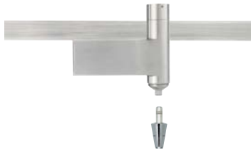
Shown approximately 15% actual size.