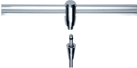
Shown approx. 25% actual size.