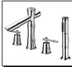
D307745 SOUTH SEA™