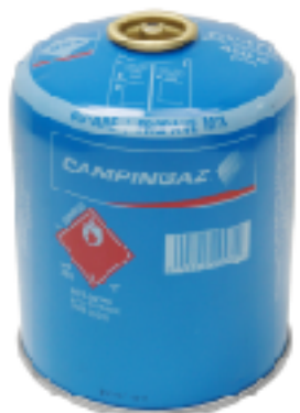
PROPANE/BUTANE Camping GAZ® CV-470 / CV-270