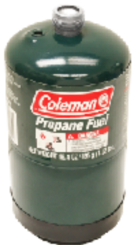
PROPANE DOT-39 NRC 228/286