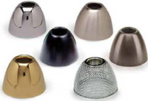
Shown approx. 30% actual size.