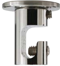
Line-Voltage: Shown approximately 60% actual size.