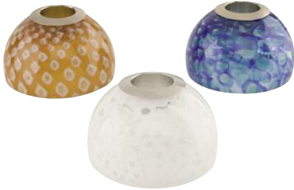
Shown approx. 30% actual size.