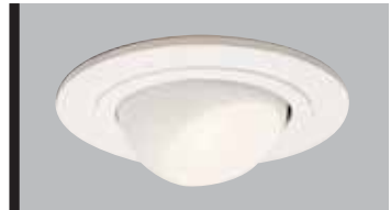
998P White Trim with White Trim Ring