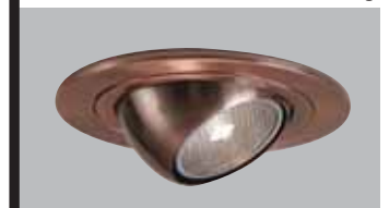
998AC Antique Copper Trim with Antique Copper Trim Ring