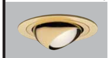
998PB Polished Brass Trim with Polished Brass Trim Ring