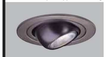
998TBZ Tuscan Bronze Trim with Tuscan Bronze Trim Ring