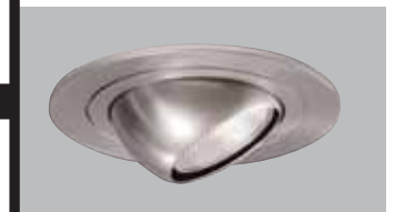
998SN Satin Nickel Trim with Satin Nickel Trim Ring