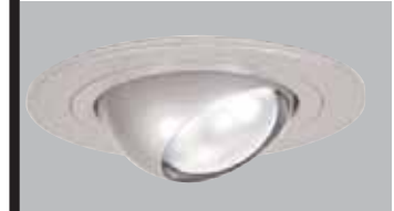
998SL Silver Trim with Silver Trim Ring