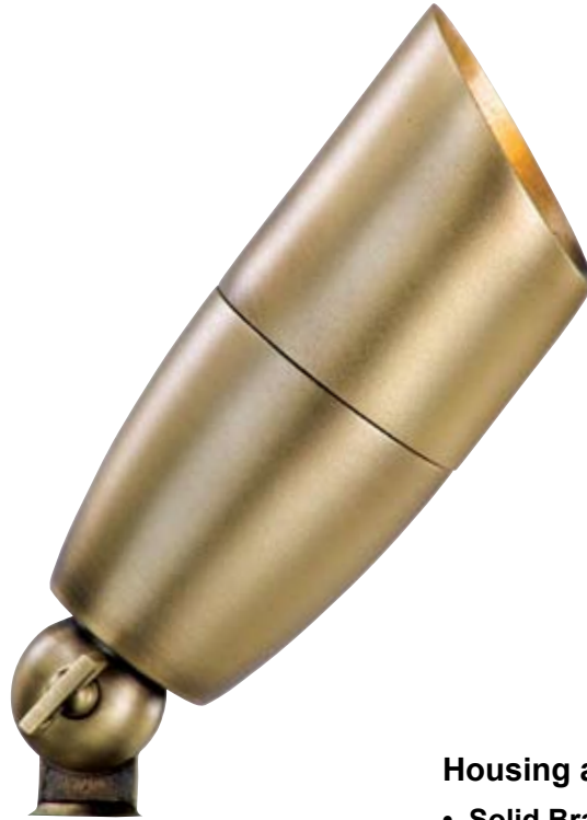
F419 Natural Antique Brass (NAS)