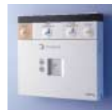
Convenient Remote Control