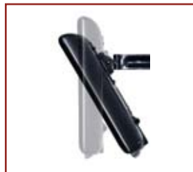
Pre-tensioned tilt mechanism offers up to \pm 35^\circ of tilt