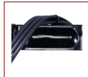
Integrated cable management keeps cables and cords out of the way