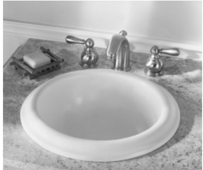
Shown with Hampton 8" Faucet (7881732.295)