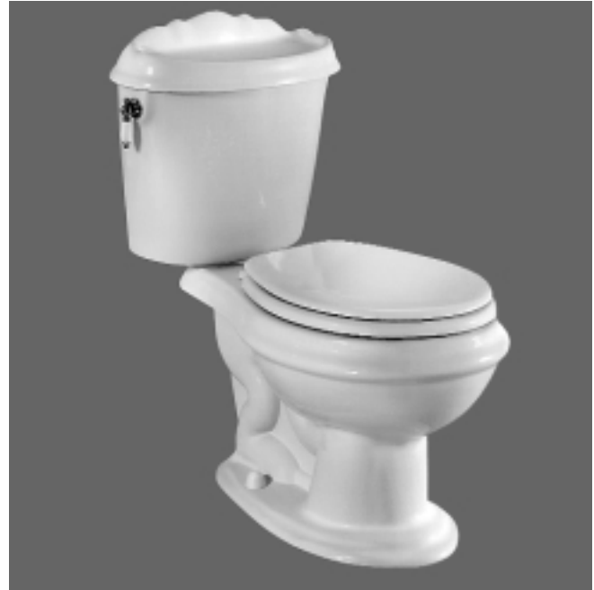
Shown with 5311.012 "Laurel" seat