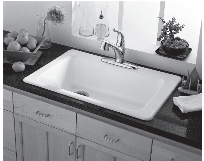
Shown with 4114.100 Lakeland Pull-Out Kitchen Faucet