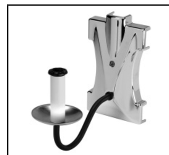
Optional LK27 Light Arm (Sold separately and individually)