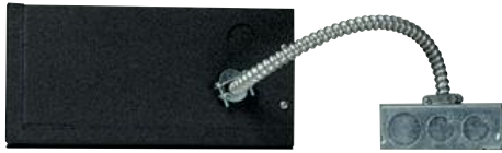
Shown approximately 10% actual size.